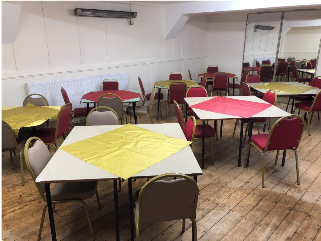
Lesser Hall (can be added for larger casts)