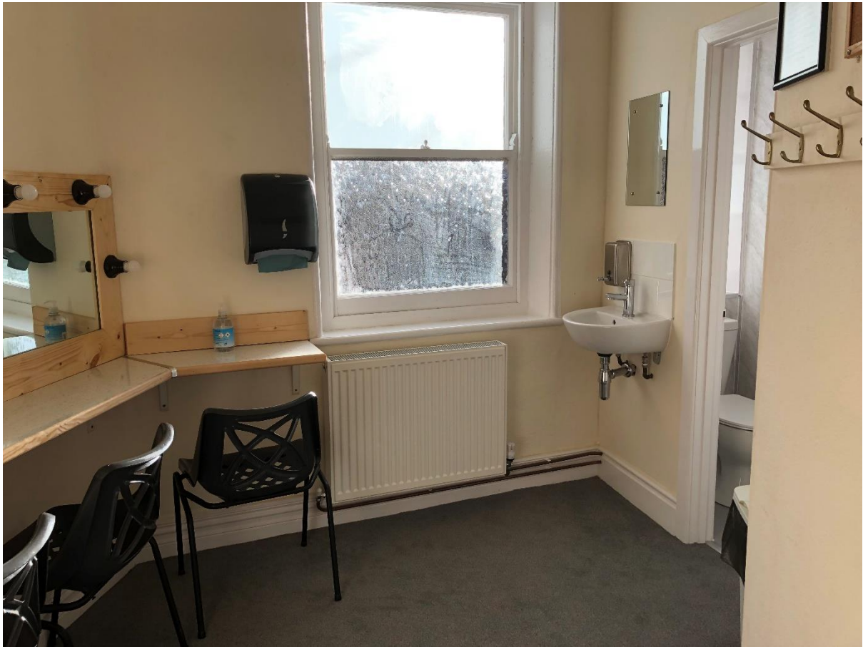
Dressing Room 1