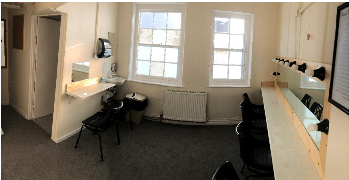
Dressing Room 2